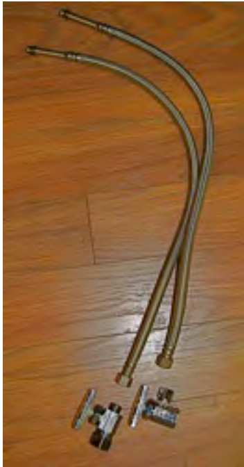
Water Supply Lines + Shutoff Valves