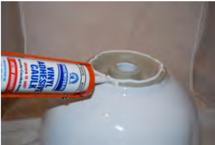
Caulking location for Porcelain Vessel Sink

NOTE: The hole diameters should be 1 5/8" hole for the sink and 1 1/4" hole for the faucet.