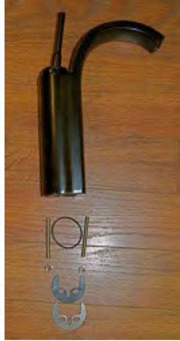
Nut & Bolt Faucet